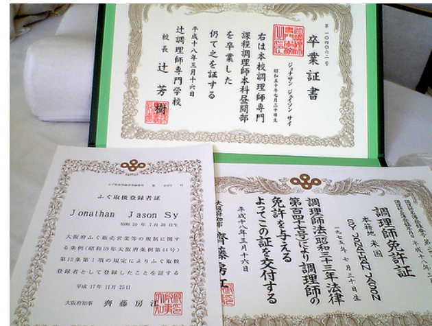
Exhibit B: Fugu Licenses